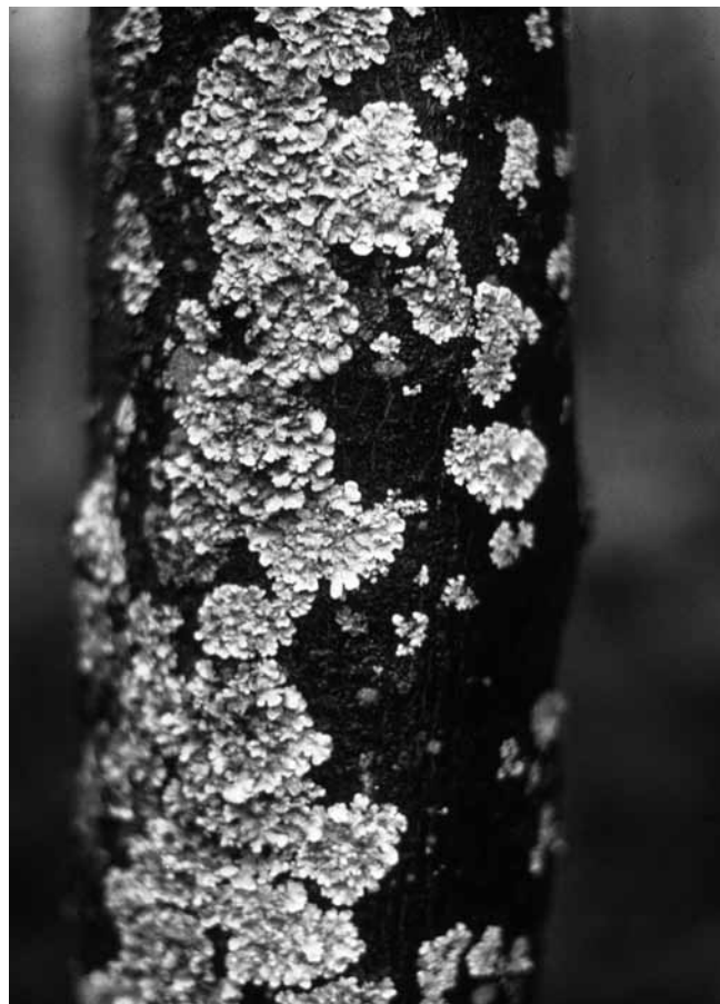
Trees help support many other living organisms, including these lichens. Far from harming the tree, lichens indicate pollution-free air.

For each tree and direction, record the number of circles that show lichens. This number represents the percentage of lichen coverage.