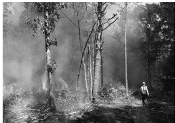
Prescribed fire in Connecticut.

Today, fire is understood as a necessary component for healthy ecosystems, and fires are often allowed to burn through vast forest landscapes. Foresters use fire in a number of ways to manage forests, grasslands, and other ecosystems. A prescribed fire (one that is planned, ignited, and managed by trained individuals) may be used to prepare a logged area for reforestation, to enhance wildlife habitat, to protect a native plant species, to control insect populations or disease, or to reduce wildfire hazard by reducing burnable fuels.