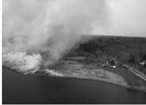
Prescribed fire in Connecticut.

Prescribed fires are different from unplanned fires, which may be caused by nature or by people. Most natural fires are ignited by lightning, but the majority of forest fires in the United States are started by humans. In 2009, for example, just under 10,000 U.S. wildland fires were started by lightning, while almost 70,000 fires were caused by human activities. City, state, and federal government agencies work to prevent unplanned fires through enhanced public awareness. Clearing vegetation around homes and businesses near the wildland-urban interface greatly reduces the number and severity of unplanned fires.